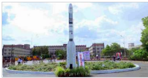
ISRO Space Expo 2022