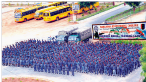
NCC Annual Training Camp