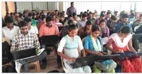
On Campus & Bangalore Training Centers