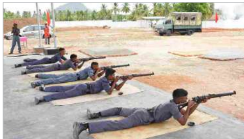
Combined Annual Training Camp