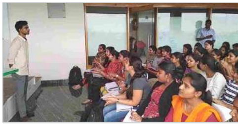
On Campus & Bangalore Training Centers