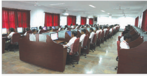
Training on Embedded Systems