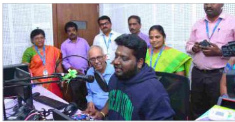
Mahendra FM 90.4 Community Radio