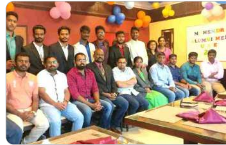
Alumni Meet at Sharjah, UAE on 23.11.2018

Mahendra Alumni Team of 1995 - 1999 batch initiated MAHENDRA ALUMNI SCHOLARSHIP SCHEME (MASS) for meritorious students. Eligible students from various branches were given scholarship to the tune of Rs.2,00,000 for pursuing their education. Awareness programmes about the latest development and trends in technology, scope for higher education and the industry requirements are conducted by the Alumni through Mahendra Alumni Inter-Lecture Series (MAILS) periodically.