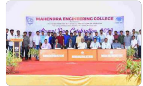
A day with Alumni in the Campus on 09 th September 2023