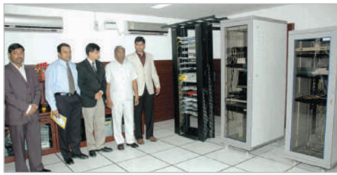
Hi-tech Data Centre